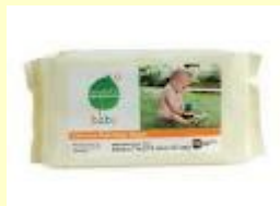
Baby Wipes Refills